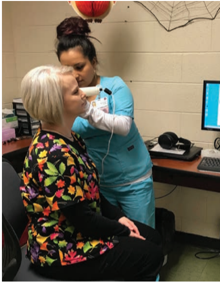
Virtual Care office visit