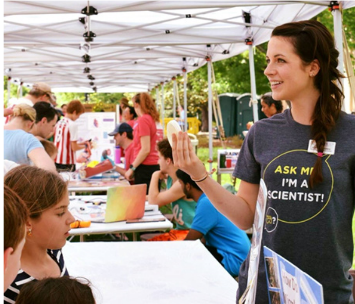
The NC Science Festival used ZOOM in 2020.

The North Carolina Science Festival worked securing broader STEM participation across the state as the multi-year grant closed. Recruitment of new Science Festival Ambassadors continued, working to reach 200 ambassadors by the end of 2020. Once the ambassadors complete training, they provide science activities in their local communities demonstrating the scientific impact of STEM activities. The festival highlights activities building awareness of science, technology, engineering and mathematics (STEM) careers and the educational, cultural and scientific impact of STEM activities.